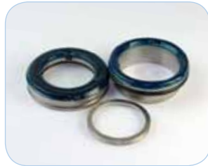
#C3201 Lower Seal