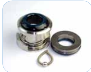
#B2102 (OS) New Style Seal