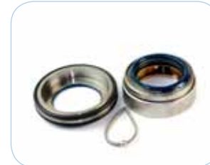
#B2250 Lower Seal Solid TC STA