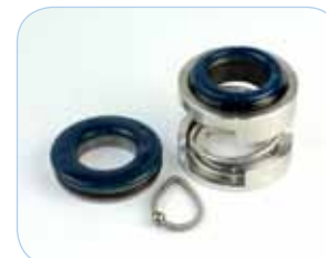
#C3101 New Seal