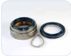
#C3200-01 Upper TC Seal