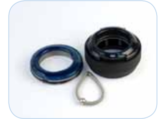
#C3151-52 Upper Seal