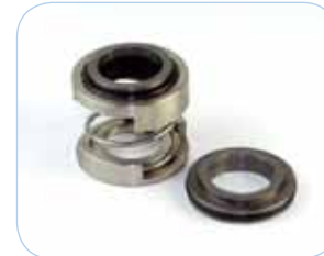
#B2125 (NS) New Seal