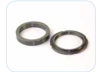
Direct replacement seal for Hydramatic 51700-019-7 New TC Faces