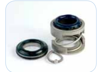
#B2125 Lower Seal