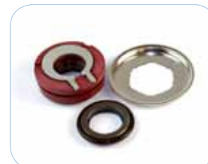
#C3102 (NS) Lower Seal