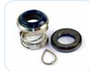
#B2151 Upper New Seal