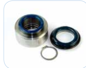
#B2151 Slurry Lower New Seal