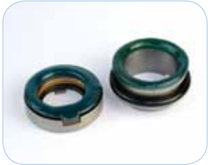
#C3126 Lower Seal