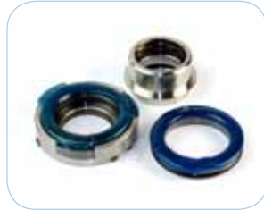
#C3127 New Seal