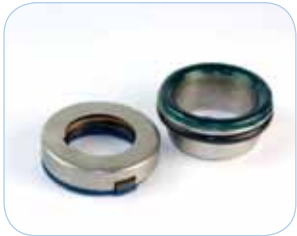
#C3152 Lower Seal