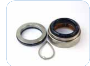
#B2250 Upper Seal