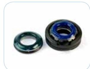
#C3085 (NS) Lower Seal