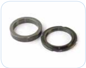
Direct replacement seal for Hydramatic 51700-050-7 New TC Faces