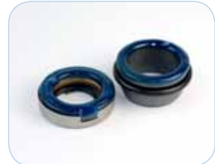
#B2151 (OS) Lower Seal