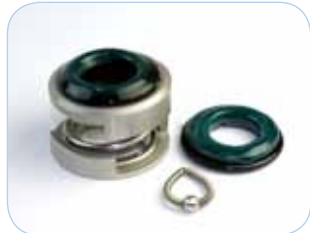
#B2102 (NS) Lower Seal

Our seals are manufactured standard with tungsten carbide faces and the seal faces maintain 0.002" parallelism and two light bands or less flatness. No modifications are required to utilize these seals since factory style retainers are used. The seals are direct replacements of the Flygt® seals currently on the market.