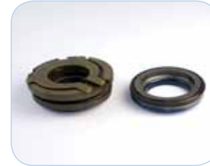
#C3127 Upper New Seal