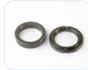
Direct replacement seal for Hydramatic 51700-016-7 New TC Faces