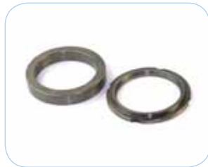
Direct replacement seal for Hydramatic 51700-052-7 New TC Faces