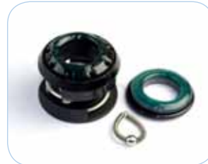
#B2102 (OS) Upper Seal