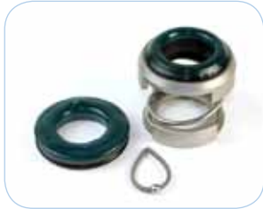
#C3126 Upper Seal